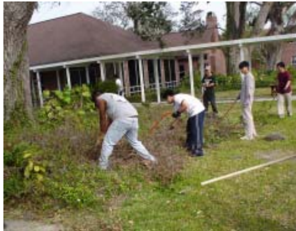
DWC students trim greenery on the seminary campus at Bay St. Louis. Fifteen students spent their Spring Break helping the SVDs at the Bay.

Now we are in a third stage. This time is problematic because there is so little one can do. Things are improving. We have electricity again. The water is drinkable. Phones are erratic but working for some of us. Yet, we seem to wait longer and longer now for something to happen. For example, the roofs have to be fixed in the residence, chapel, administration building and dining room. A contractor has examined the residence and its damaged rooms, but work will not begin until February or March. Who knows when it will be completed? The retreat center was so badly damaged we have no idea when that wonderful facility will