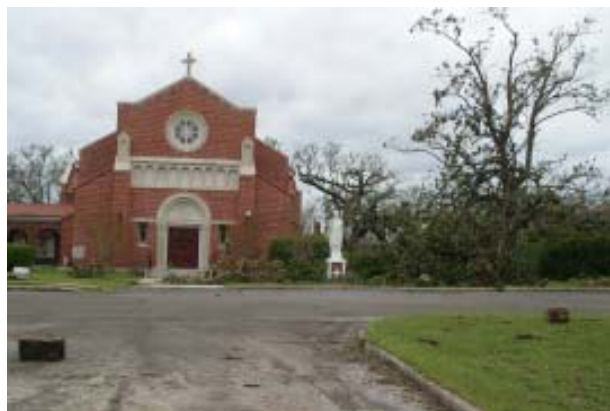
Many trees fell on the Bay campus. No structural damaged occurred due to trees, but flooding damaged much.

A group of 15 students and one SVD departed for the Bay on Friday, March 3, 2006. Five worked at St. Rose de Lima in Bay St. Louis. They helped gut and repair local homes. The others worked on the seminary campus preparing the first floor of Christmann Hall for professional contractors to complete remodeling. Some also finished clearing the grounds of debris.