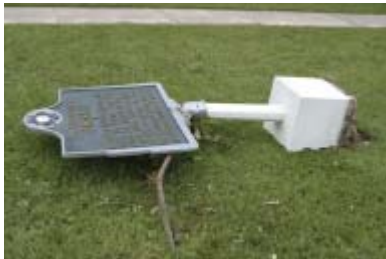
While the historical marker sign was toppled, the shrine was unharmed with some debris scattered about.

The landscape of St. Augustine's has changed quite a bit. Countless trees and shrubs are gone. All the buildings at the retreat center can now be seen from the residence; before, it had seemed like a wooded area. The cemetery, too, is now clearly visible from the office. Happily our shrines and statues survived. Despite its bleak background, the highway shrine of the Sacred Heart survived, although ten of the fourteen outdoor Stations of the Cross did not. The Lourdes Shrine, Second Street statue of Mary, statue of St. Augustine, second statue of the Sacred Heart, St. Anthony, and other smaller statues all survived. In the chapel, the faces of the Crucified Savior and St. Peter Claver fell off due to excessive moisture but have since been repaired.