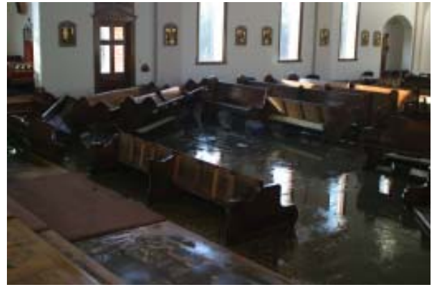
Floods damaged the floors, pews and other parts of the recently renovated historic chapel.

The provincial house and offices have to be abandoned. New structures will be built, probably on Second Street. The chapel pews were tossed about and broken. They will