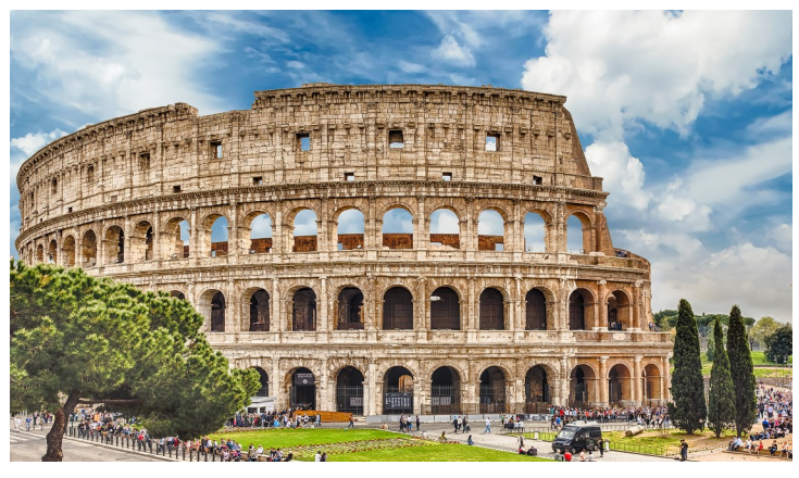
Colosseum ~ Rome