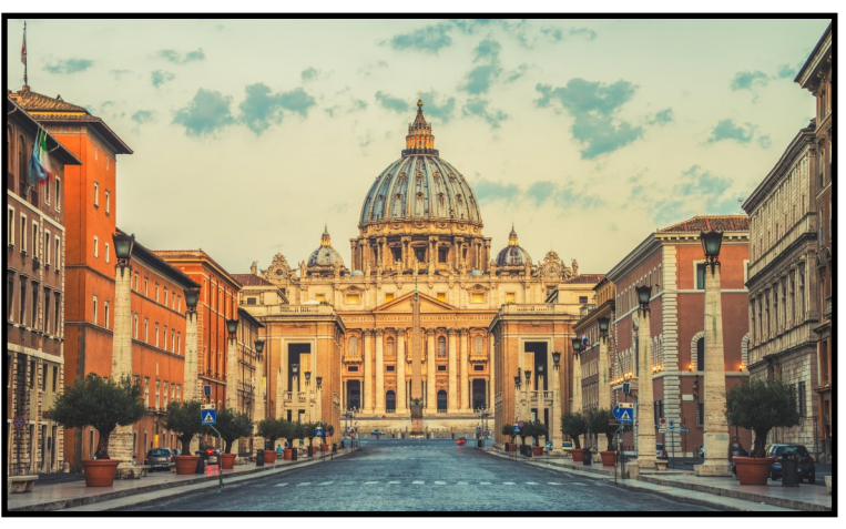
Clockwise from Left to Right: Steyl, Netherlands ~ Amsterdam, Netherlands ~ The Vatican, Rome