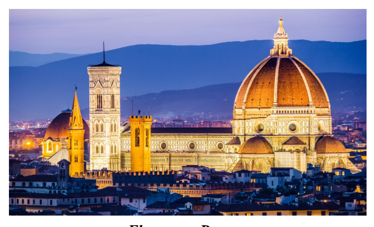
Florence - Duomo